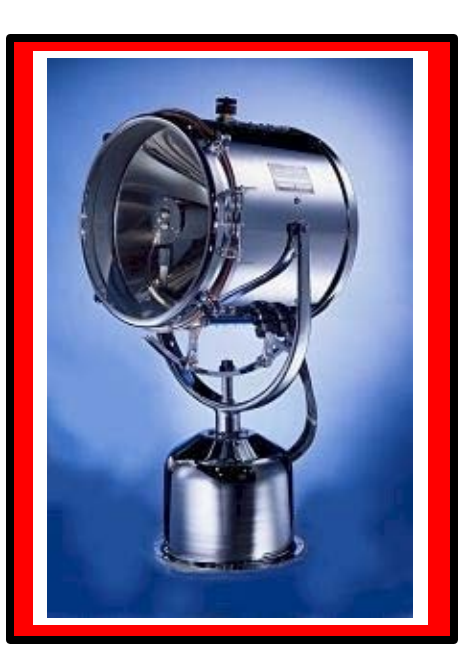
500 Watt Xenon <u>45</u> Million Candlepower Distance = 6KM (4 Mi.)