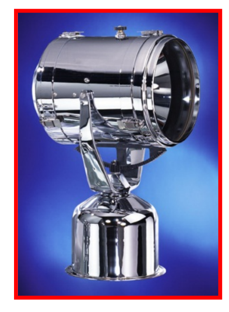
350 Watt Xenon <u>25 Million Candlepower</u> Distance = 4.5KM (3 Mi.)