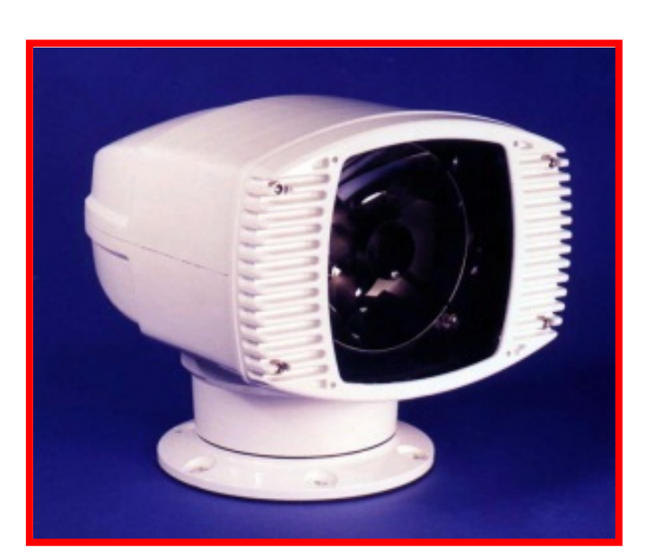
200 Watt Xenon <u>15 Million Candlepower</u> Distance = 3KM (1.85 Mi.)